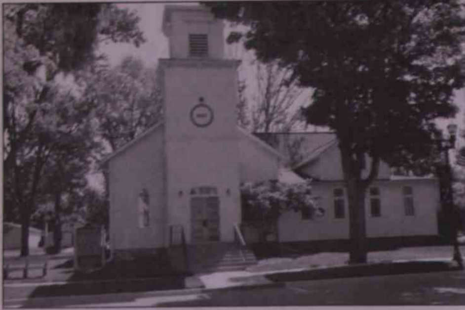
The Vermontville United Methodist Church will recognize its sesquicentennial with a special event on Sept. 20.