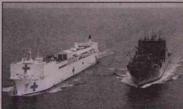
PACIFIC OCEAN - Hospital ship USNS Comfort (T-AH 20) receives supplies from supply ship USNS Peary (T-AK 5) as Comfort heads for its liberty port in Panama July 16 here. Teams onboard Comfort have been on a four month humanitarian and civic assistance mission called Continuing Promise 2009.