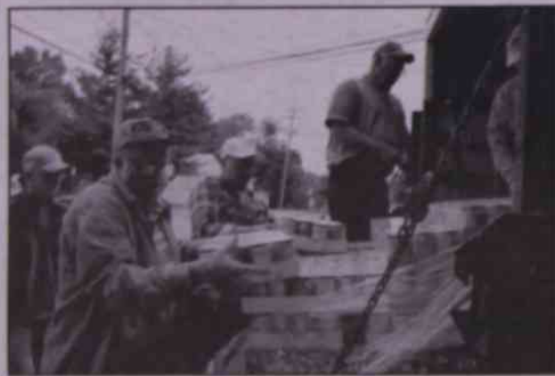
Each Tuesday morning, rain or shine, nearly 20 volunteers work to unload supplies and distribute them to families at the food pantry.

success on car show day if just one person with more volunteers came out for clothes." it or if we were able to help